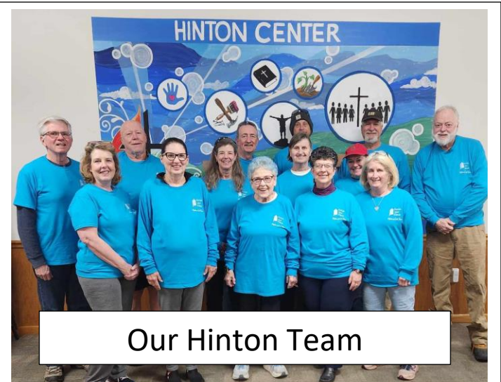
Our Hinton Team